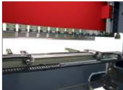
X-R-Z1-Z2 4 axis backgauge (optional)