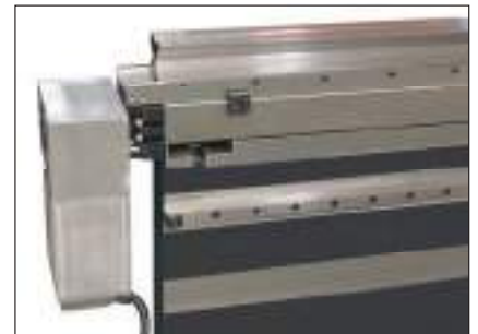
CNC table crowning system with wedges (standard)