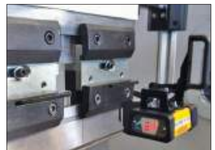
Front laser safety system (standard) Quick release top clamping system (standard)