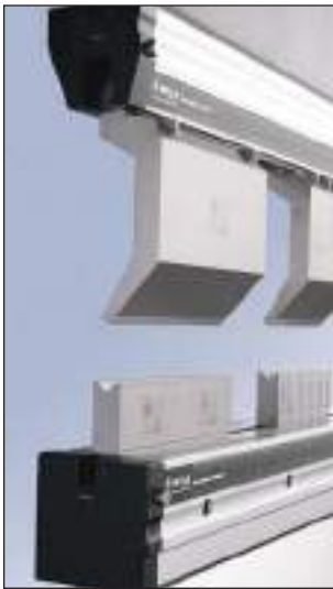
Top & bottom hydraulic Wila clamping systems (optional) Different type of hydraulic & pneumatic clamping systems are available upon request as an option.