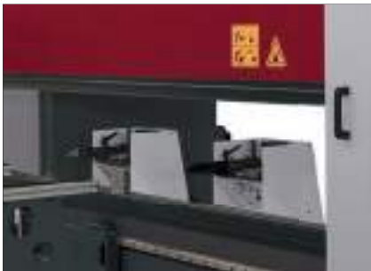
X1-X2-R1-R2-Z1-Z2 6 axis ATF type backgauge (optional)